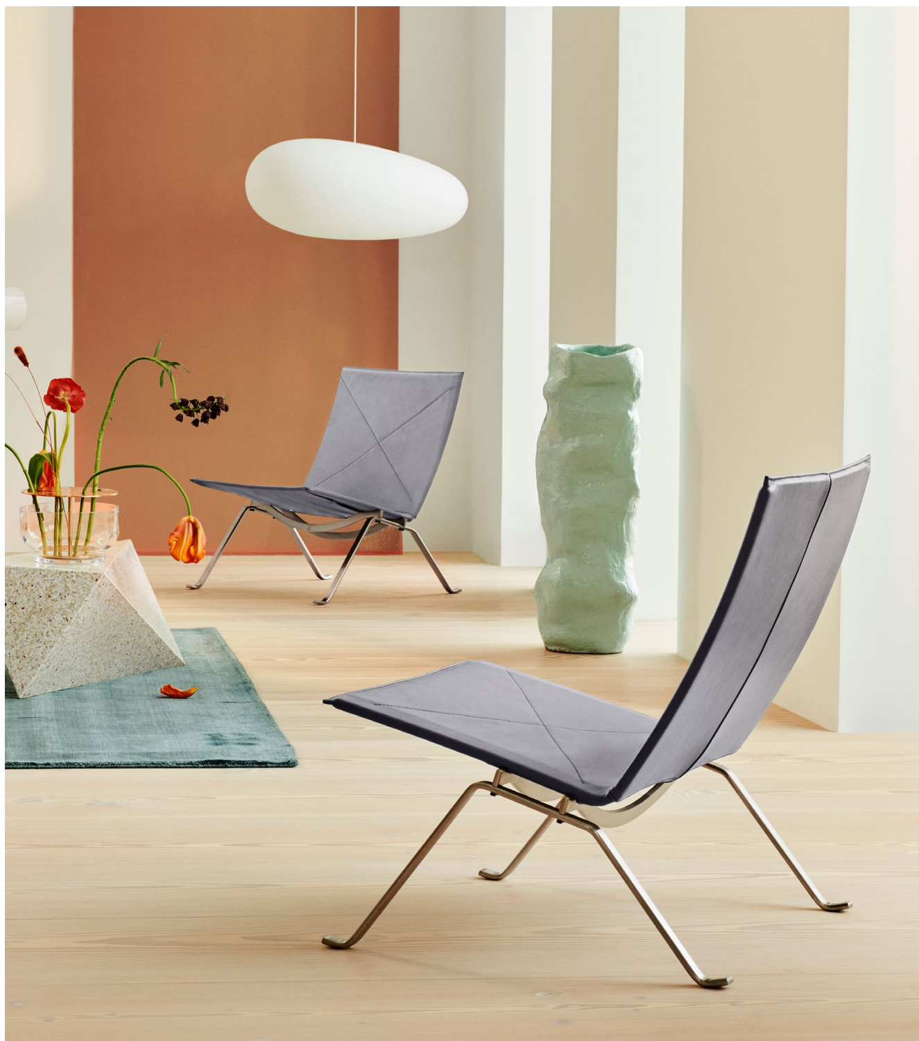
PK22™ PRODUCT FACT SHEET